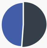
FOTO submitted for 3,248 TINs/NPIs for the 2021 MIPS reporting year. The results for this group were astounding: